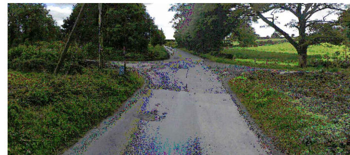
Image No. 7 (Looking Towards Substation) Looking at Section A-A. Scale: NTS